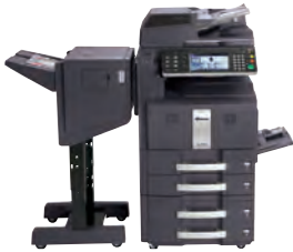
Shown with Optional DSDP, 500 x 2 Tray, and 1,000 Sheet Finisher 48.8 W x 26.8 D x 48.8 H