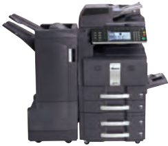
Shown with Optional DSDP, 500 x 2 Tray, and 3,000 Sheet Finisher 50.9 W x 26.8 D x 48.8 H