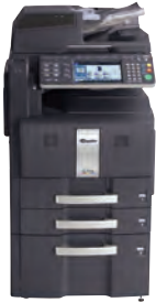
Shown with Optional DSDP and 3,000 Sheet LCT 23.8 W x 26.8 D x 48.8 H